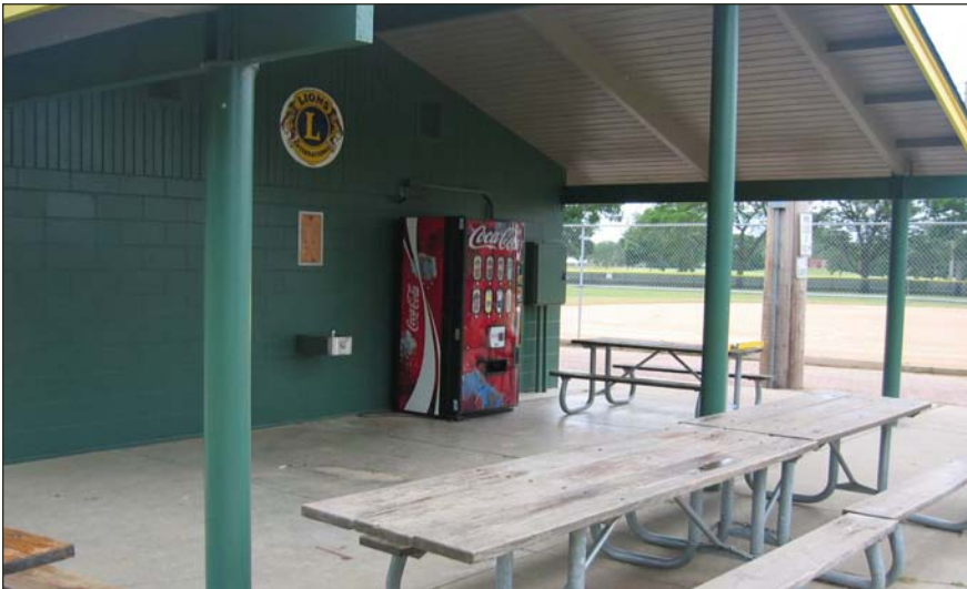
Picnic Shelter with Bathrooms, Vending Machine, and Drinking Fountain