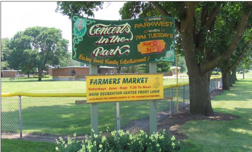
Corner signage next to baseball field