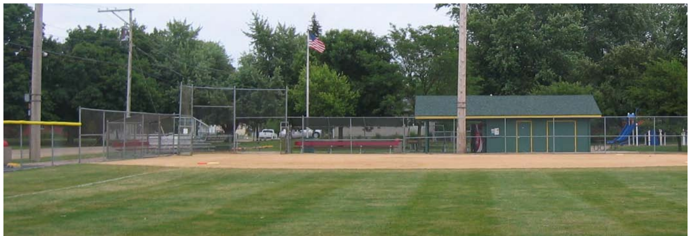
Baseball/ Softball Field