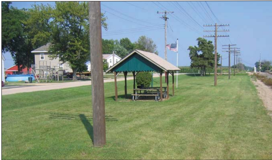
Picnic Shelter with tables