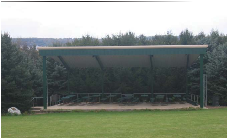
Amphitheater at Park West