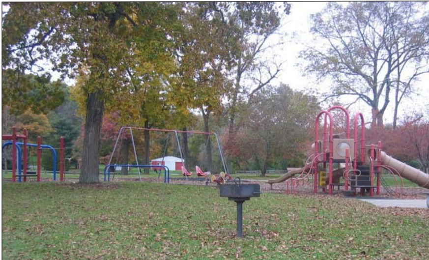
Playground and grill area