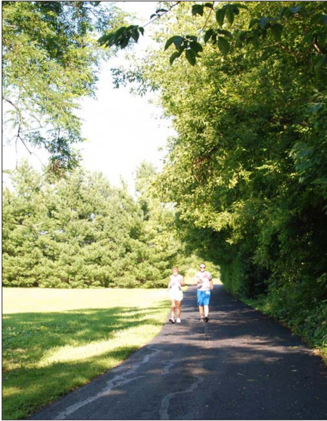
Trail Connection to Residential Area