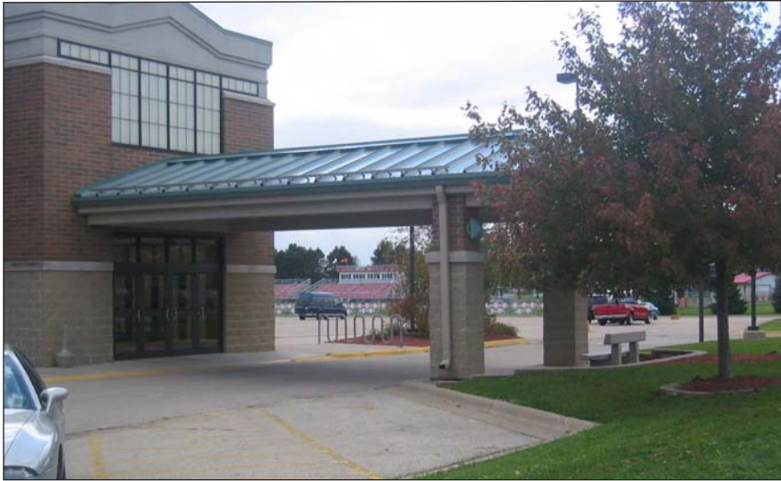
Main Entry and Landscape