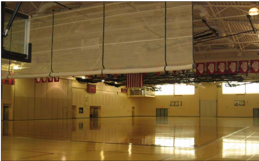
Patio and Garden